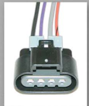
NEW VEHICLE HARNESS INCLUDED WITH FUEL PUMP MODULES