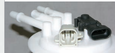
GM Fuel Pump Module with Old Harness Connector