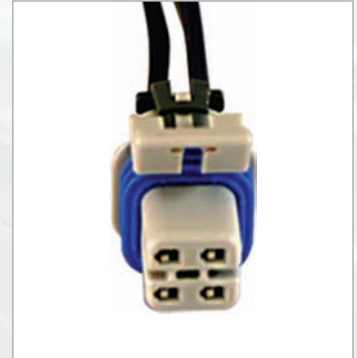
Old Vehicle Harness Sold Separately

Fuel pump modules with the improved 4-pin connector require vehicle harness replacement. One of the five application-specific, color-coded vehicle wiring harnesses is included with every pump that uses the new connector.