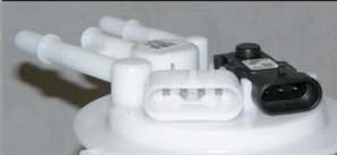
GM FUEL PUMP MODULE WITH NEW HARNESS CONNECTOR