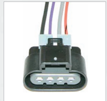
New Vehicle Harness Included with Fuel Pump Modules