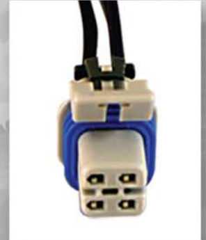
OLD VEHICLE HARNESS SOLD SEPARATELY

Fuel pump modules with the improved 4-pin connector require vehicle harness replacement. One of the five application-specific, color-coded vehicle wiring harnesses is included with every pump that uses the new connector.