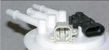
GM FUEL PUMP MODULE WITH OLD HARNESS CONNECTOR