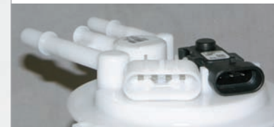
GM Fuel Pump Module with New Harness Connector