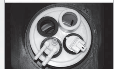
Improperly positioned fuel pump module assembly