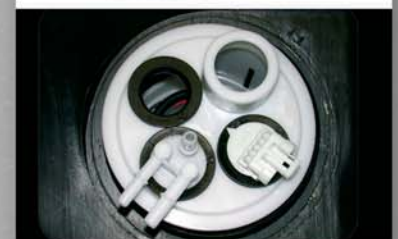
IMPROPERLY POSITIONED FUEL PUMP MODULE ASSEMBLY