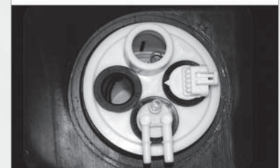
Properly positioned fuel pump module assembly