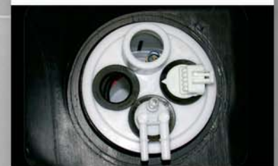
PROPERLY POSITIONED FUEL PUMP MODULE ASSEMBLY