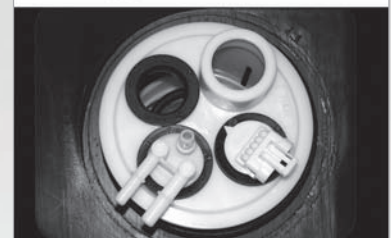
Improperly positioned fuel pump module assembly